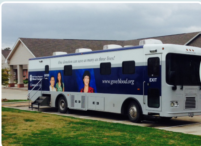
Blood Drive at TLC

On March 4th, TLC partnered with Gulf Coast Blood Center to host a Blood Drive. We were pleased to have many donor's signed up and even some unexpected walk-ins! According to Gulf Coast, TLC met their donation goals. The Blood Center coach will be back in a few months for another drive.