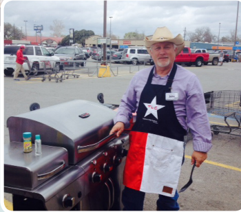
Columbus Community Food Drive